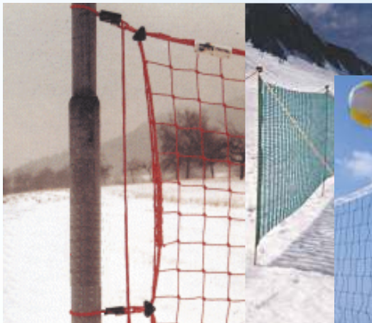
Cleats used to tension snow netting