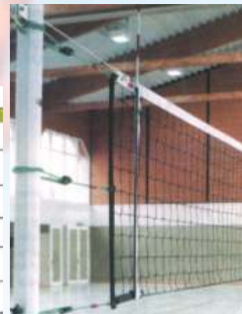
Cleat to tension volleyball nets, badminton nets and lightweight, portable nets (CL260).